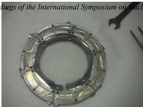
Fig.1 Rotating target design view.