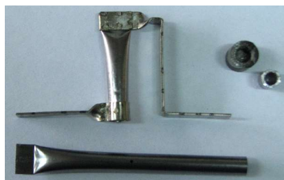
Fig.2 , Ta boats and crucibles

In order to minimize the material loss of expensive isotopic Sn material, special crucibles and boats were used in evaporation. Minimizing the distance between the source to substrate is another step taken to minimize the material loss. The backing foil mounted on a target frame or glass slides were kept at an optimum distance of ~6cm to maximize the collection of Sn vapor. Available amount of isotopic Sn was only 100mg and it was necessary to ensure the success in one evaporation of isotopes. In order to minimize the possibilities of failure, several trial attempts were made with natural Sn prior to isotopic Sn evaporation. Target laboratory was successful in the fabrication of expensive isotopic targets of ^{116}\text{Sn} , ^{118}\text{Sn} , ^{122}\text{Sn} , and ^{124}\text{Sn} by evaporation method.