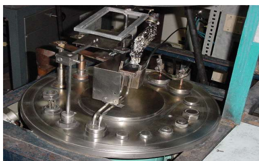
Fig.1 Evaporation set-up

Thin targets of Sn were fabricated by vacuum evaporation. A diffusion pump based coating unit was used in this work. A layer of NaCl of 100nm was used as parting agent. Sn and NaCl were deposited by electron beam technique and thermal evaporation technique respectively. Evaporations of Sn and NaCl were performed sequentially without breaking the vacuum in between the evaporations. We also observed that floating of self-supporting films was not successful when evaporation were not