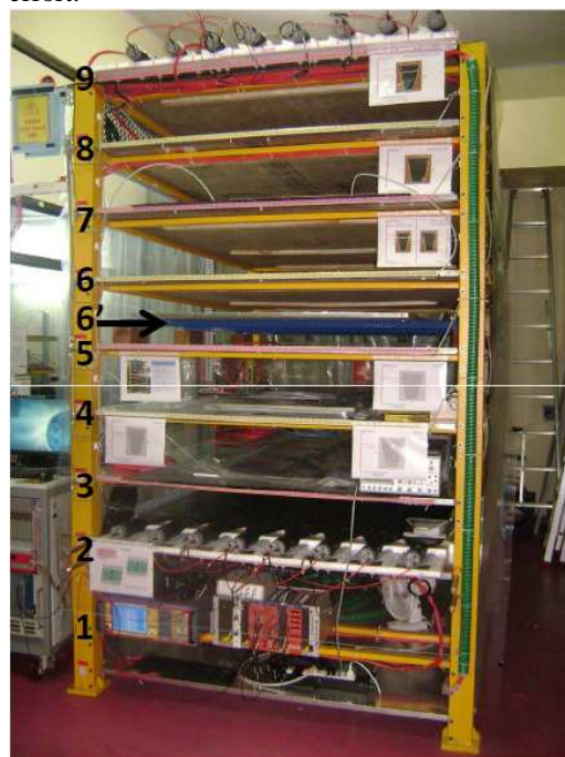
Fig. 1 Cosmic Rack at NPD for characterization of RPCs with the scintillator hodoscope loaded in shelf # 2 and # 9

taken around the cosmic rack. Each of the wooden shelves are cladded with 1 mm aluminum sheets for providing efficient grounding. The process of characterizing the RPCs first requires the bare gas-gaps to be tested for their mechanical and electrical properties before being configured into an RPC. In order to load and unload these gas-gaps/RPCs, a special scissor lift had been designed and commissioned in RPC lab., which provides a working platform of 1.50 m x 2.25 m, with a SWL of 500 kg and can be raised or lowered, electrically, from a collapsible height of 60 cm to 300 cms above the ground with precise control. The scissor lift has a rotating platform on top, on which first the RPCs shall be assembled and then guided inside the shelves by rotating its platform, without much effort.