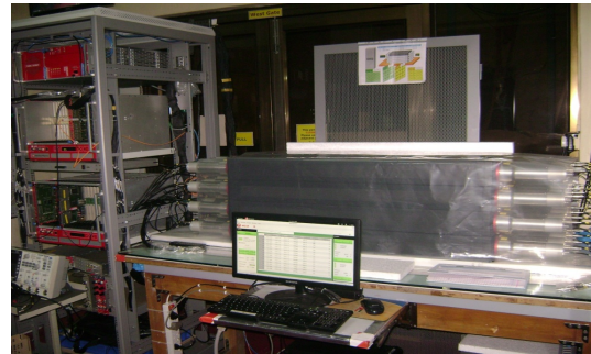
Fig 1: Prototype detector setup of 4 \times 4 PS bars with digitizer DAQ in non-reactor environment

The prompt signal in detector will comprise of the kinetic energy deposited by positron and two 0.511 MeV gammas from its annihilation. The neutron would eventually thermalize in the active volume of the detector and would be captured by a Gd nucleus. The cascade of gamma rays, coming from the de-excitation this nucleus, forms the delayed signal. The current studies have been performed using 16% of the proposed detector which comprises of 16 bars in a symmetric 4 \times 4 arrangement with the data being read through CAEN V1730 digitizers as shown in the Fig 1.