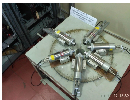
FIG. 1: The VENTURE array [4].

However, it has been seen in many of these nuclei, there are several low-lying isomers which are deterrent to access low-spin levels in them. In the present work, thus we intend to study the low-lying levels of ^{160-162}\text{Dy} nuclei through decay spectroscopy of Ho isotopes. There are a few lifetimes of 1-1000 ps order [3] which can be remeasured using the Mirror Symmetric Centroid Difference (MSCD) technique more accurately. Thus we report here the result of our effort to revalidate the previous measurements of lifetimes of levels in these nuclei.