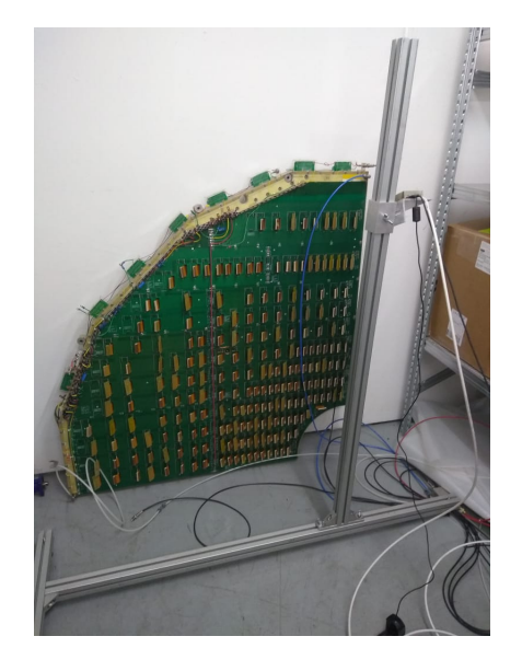
FIG. 1: Systematic arrangements of X-Ray testing.

moved to next test point at a distance of 10 cm approximately.