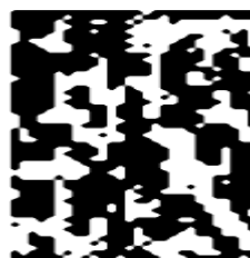
Fig. 4 Shadowgram on the detector

The source-mask distance was fixed at 10 cm. The shadowgram onto the detector at varying mask-detector distances were then generated. Fig.4 shows one such shadowgram for the mask-detector distance of 30 mm. The shadowgram does not completely resemble the mask pattern. This may be due to the near field nature of the set