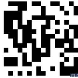
Fig.2 16x16 mask pattern designed. The black blocks represent the opaque mask elements

Uniformly Redundant Arrays (URA) satisfy this criterion and they can be generated from a Cyclic Difference Set (CDS). Mask pattern for which all separations between pairs of holes occur a constant number of times, is called URA [5]. A CDS, characterized by parameters n, k and z , is a collection of k integer numbers \{I_1, I_2, \dots, I_k\} with values I_i between 0 and n such that for any positive J \pmod n , congruence I_i - I_j = J \pmod n has exactly z solution pairs (I_i, I_j) within the set [4]. If n = 2^m - 1 , where m is a positive integer then the set is termed as Pseudo Noise Hadamard Cyclic Difference Set (PNHCDS). [4] This was constructed using SRA. Starting from mask pattern length ‘ n ’, Irreducible Primitive Polynomials (IRA) of degree m were used as generating functions to model the URA mask as shown in figure 2. The first ‘ m ’ elements of the binary sequence representing the set is chosen arbitrarily and the subsequent elements are then generated using the following SRA [1]