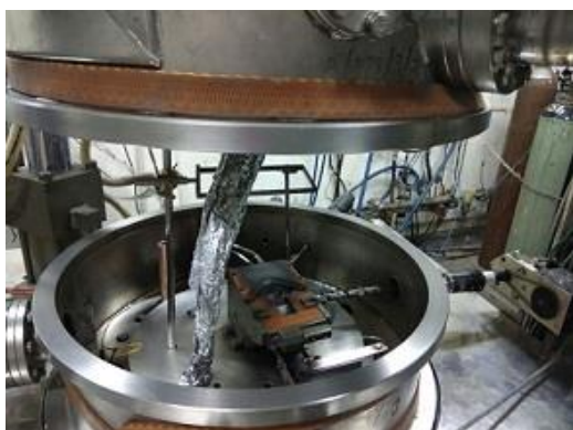
Fig. 1: Inside view of turbo based evaporation assembly.

In order to overcome this problem, before the next deposition, the thickness of carbon backing was increased from existing 20 \mu\text{g}/\text{cm}^2 to 35 \mu\text{g}/\text{cm}^2 . In the final deposition with enriched material, the carbon coated glass slides were kept at 24 cm and 8 cm away from quartz crystal and electron gun arrangement respectively.