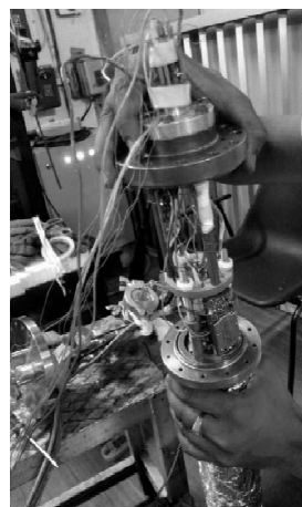
Fig. 1: Trap assembly with detection circuit inserted in vacuum chamber

Recently the complete PIT components were put together, the trap assembly along with detection circuit were put in a vacuum vessel shown in Fig.1. Ultra high vacuum ( \sim 10^{-9} mbar) was achieved in the chamber by month long pumping where the setup had been routinely warmed upto 80 °C. Once the ultimate vacuum was achieved, the trap chamber was disconnected from pump by pinching off the connecting tube and the chamber was immediately inserted in the liquid helium bath. After dipping the system, about a week was given for cryo-pumping and thermalization and then trapping operation was started. In order to achieve the required vacuum condition through cryo-pumping, special precautions were taken as described in the following section.