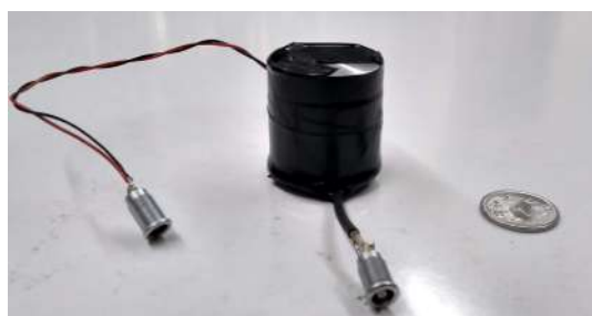
FIG. 2: SiPM coupled with 1" LaBr 3 :Ce

The second part of the measurements involved determination of the absolute light yield of the LaBr 3 :Ce crystal using SiPM chips. The 25.4 mm × 25.4 mm crystal from Saint Gobain Inc. was viewed by 6mm × 6 mm SiPM from SensL having 18,980 pixels with each pixel of size 35 \mu . The SiPM was mounted on printed circuit board (PCB) designed using OrCAD [5] software for read out signal. Output signal ( V_0 ) was measured on an oscilloscope using 662 keV \gamma -rays from 137 Cs source. The total charge generated by the visible photons impinging upon the SiPM pixels was determined. By using the known value of the quantum efficiency of the SiPM and the measured total charge, the number of visible photons impinging upon the SiPM was determined. After applying necessary corrections the number of visible photons produced for 1 MeV \gamma -ray energy was found out to be 57,675 for LaBr 3 :Ce at 380 nm. The corresponding quantum efficiency of detector is 18.8%. This is in very good agreement with what is determined from optical measurements and quoted by the manufacturer [3].