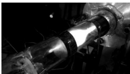
FIG. 1: Capacitively Coupled Plasma (CCP), inside the ion source.

The constructed ion source, which generates Capacitively Coupled Plasma (CCP)