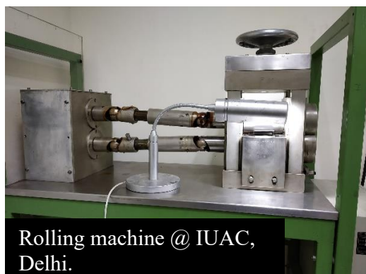
Figure 1. Photograph of rolling machine at IUAC.

down successfully to thickness \sim 1.4 \text{ mg/cm}^2 using cold rolling method.