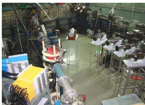
Fig. 1 A typical experimental setup consisting of LAMBDA array along with ancillary detectors

The systematic trend of the data seems to disagree with the TSFM. The model predicts the gradual increase of GDR width from its ground state value whereas the measured GDR widths appear to remain constant at the ground state value up to certain temperature T_c (following an empirical relation 0.7 + 37.5/A ) and increases thereafter. With the availability of new data at low temperatures, theoretical interest has also grown up. To explain the suppression of GDR width with respect to TSFM a new phenomenological model called critical temperature included fluctuation model (CTFM), has been proposed [8] which explains the measured data quite well. It should be highlighted that, by including the pairing fluctuation filed in the TSFM calculations, the GDR width has recently been fairly well described at T < 1.5 MeV in open-shell nuclei [12]. In addition, the measured data is well reproduced by the microscopic phonon damping model (PDM) [13,14].